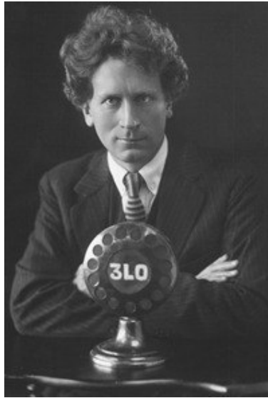
Percy Grainger, 1926

silver gelatin print, one of a series of promotional images for ABC Radio 3LO taken by Ruskin Studios during Grainger's 1926 tour of Australia and New Zealand Grainger Museum, the University of Melbourne